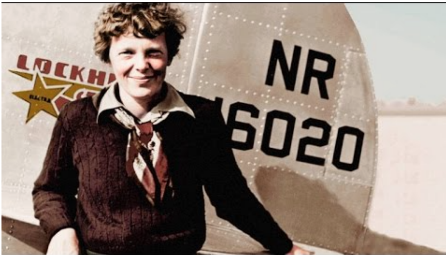
Amelia Earhart, the first 99s elected president.