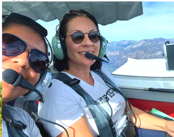
Above: In the cockpit and ready to go

Eve is also mom to an awesome some 16-yr-old daughter who Eve describes as "the world's kindest soul".