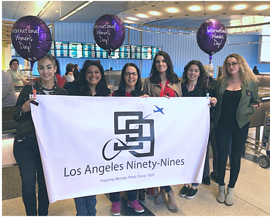
Los Angeles 99s at LAX