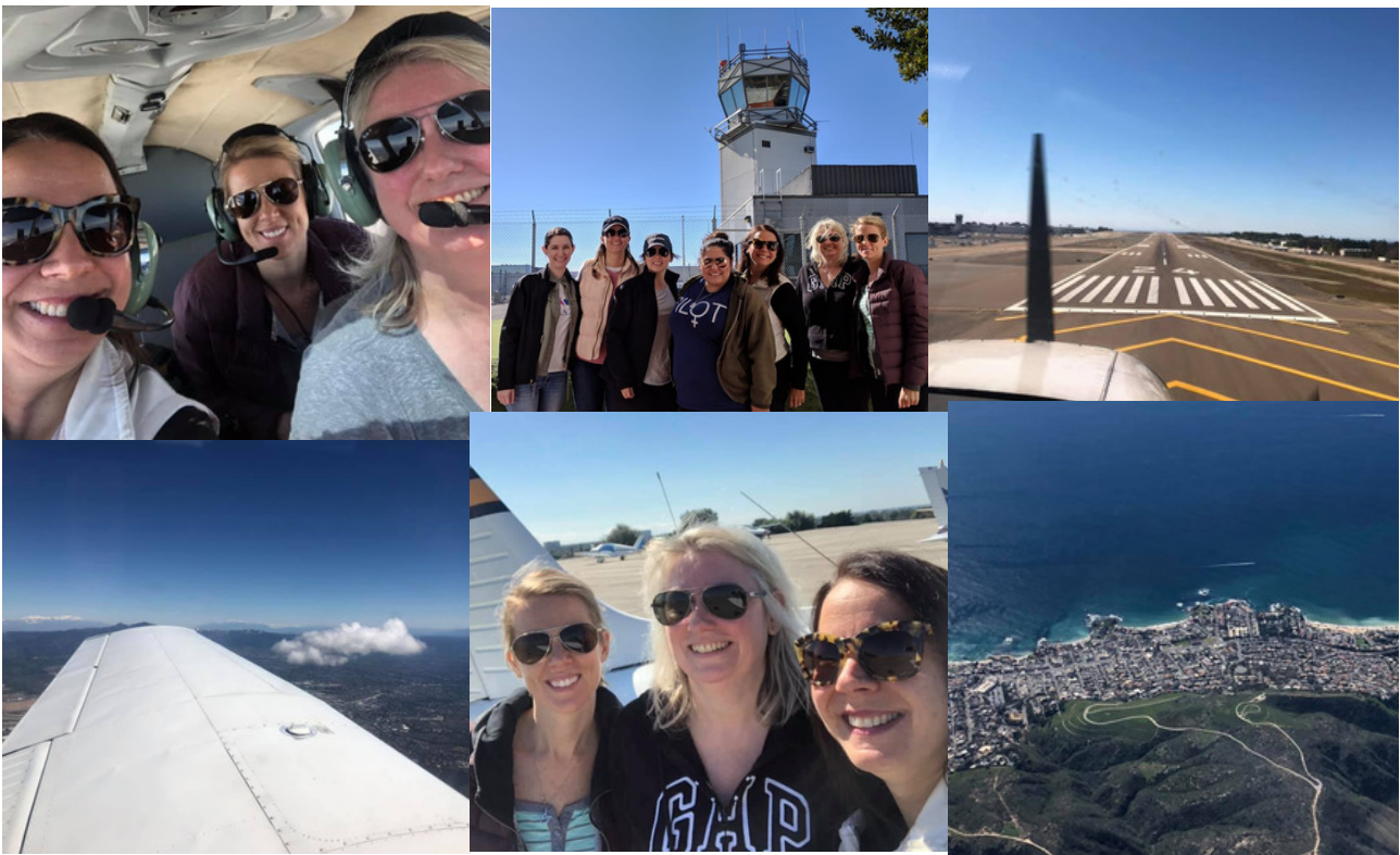
Some of our LA 99s enjoying the day during our fly-in from Santa Monica to Palomar.

A single cloud in the sky kind of day means it is a great day for a chapter fly-in. On Saturday, February 23, three planes successfully headed south to Palomar airport for lunch at The Landings. It was a perfect day for flying as the rain stopped and many other pilots were out and about too. Some planes in the pack moved a little faster than others, but when we all arrived we all enjoyed a great lunch in the sun and time with each other.