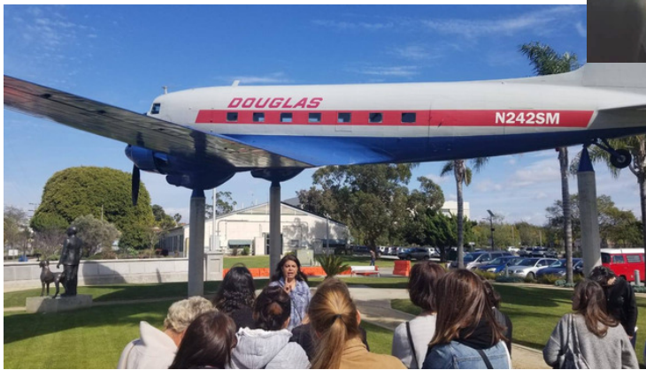
Museum of Flying