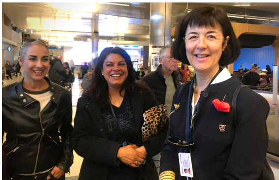
Tom Bradley Terminal at LAX