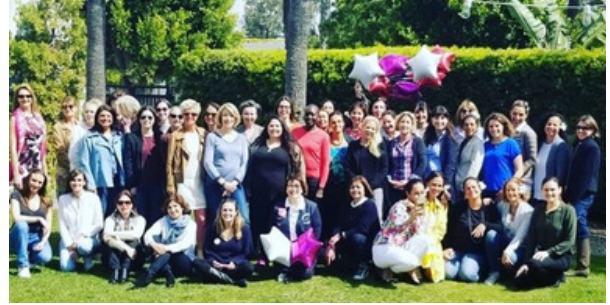
Los Angeles 99s and Air France Crews