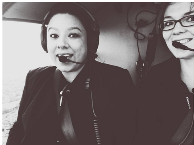
In then cockpit