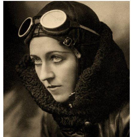
Amy Johnson became the first female pilot to fly solo from Britain to Australia

Had I been a man I might have explored the Poles or climbed Mount Everest, but as it was, my spirit found outlet in the air- Amy Johnson